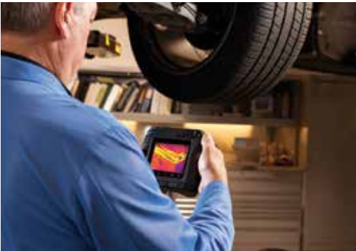
Ease of operation and ergonomic design make the T500 series an essential tool for product development and research