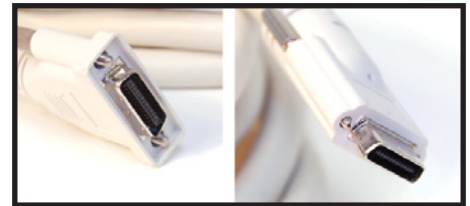
Screw lock connection